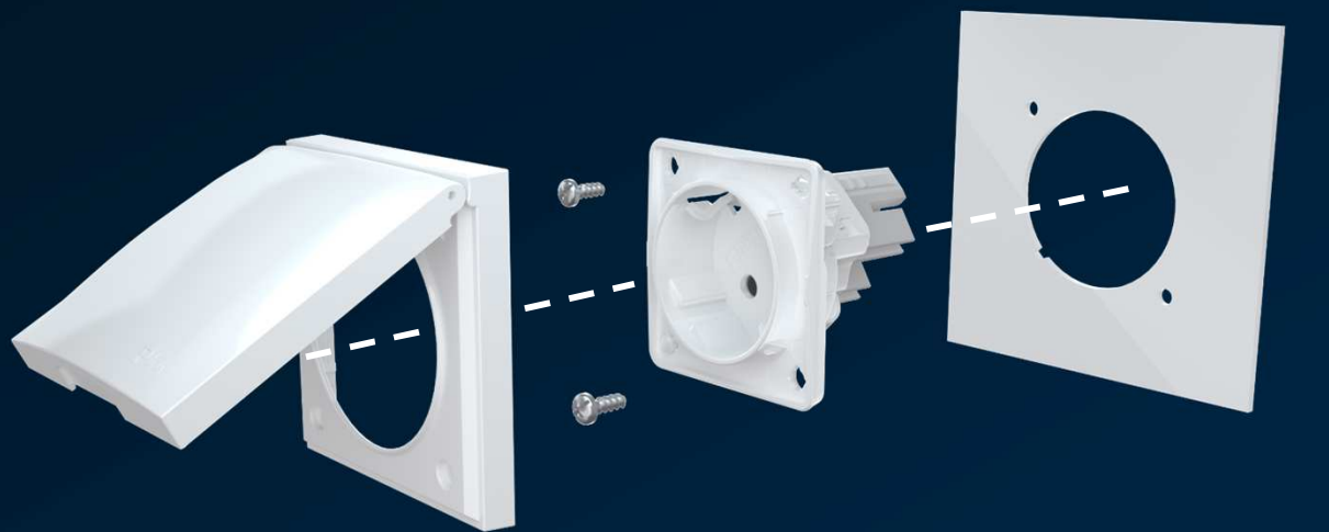
Frame with hinged cover (optionally with "IP44" print)

Our modular system with ideal extensive series solutions for customer-specific requirements in laboratory and medical technology.